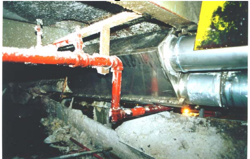
Air Extractor Unit