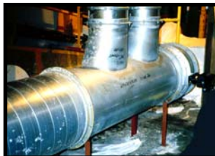
3-Way Suction Hood w/ Automatic Control Damper